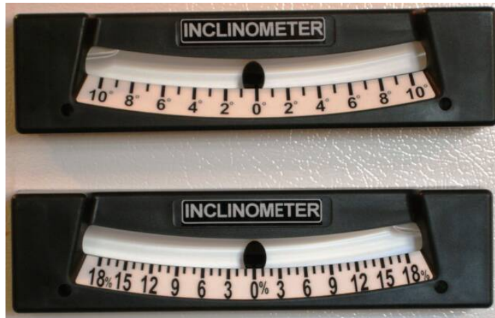
Fig 2 – Typical ‘Inclinometer’

Machines that are rated per the Australian Standard at greater than 1000 kg should be fitted with lowering control valves that allow the machine to meet the requirements of ISO8643.