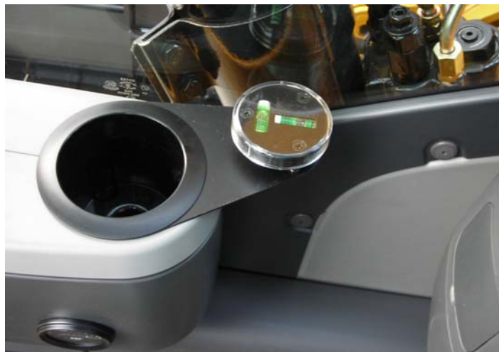
Fig 1 – Typical ‘Level Indicator’