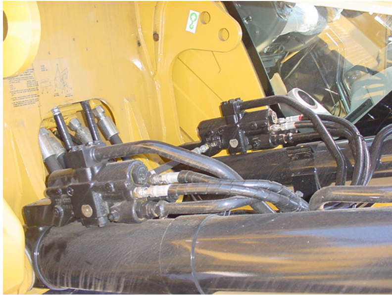
Fig 3 - Typical HEX Boom Lowering Control Valve Installation.