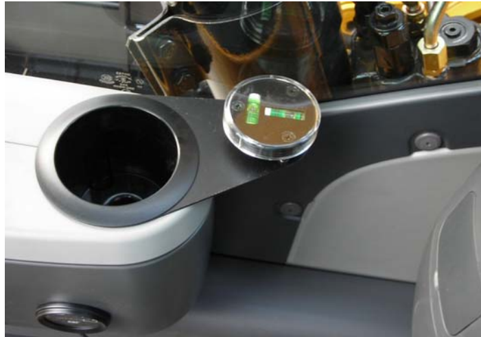
Fig 1 – Typical 'Level Indicator'