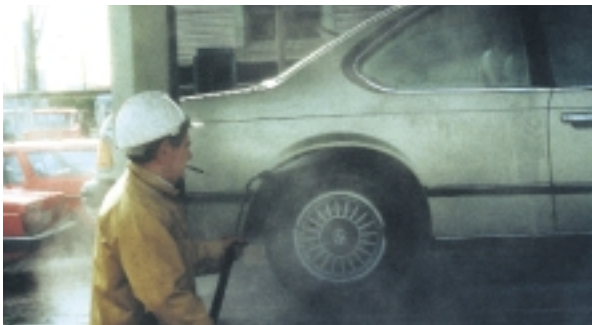
Importers are advised to thoroughly clean machinery off-shore.