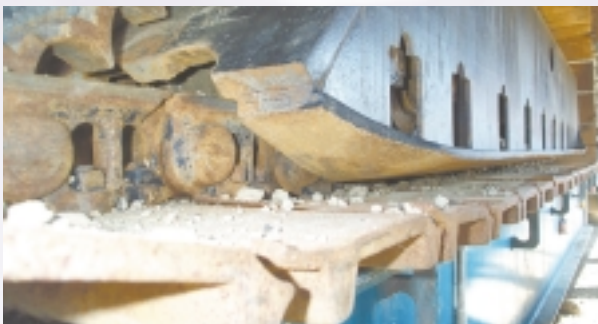
Soil contamination on machinery that was re-exported.

Australia has among the strongest quarantine measures anywhere in the world.