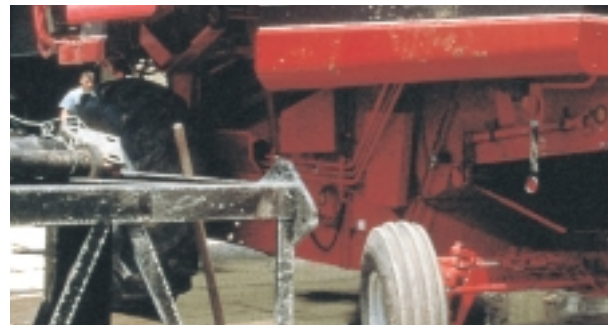
This header was re-exported even though it looked clean, because of unacceptable soil and plant contamination.

Many shipments of used machinery have already been refused importation and ordered for re-export. These consignments have included a bulldozer, wheel loader, wool carbonising machinery, chocolate processing equipment, excavator, drilling rig, soil compactor, soil stabiliser, backhoe and grader, forklift, hay baler and log loader.