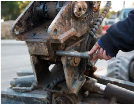
Photo 2: Shows a worker locating the safety pin for the semi-automatic quick hitch. This is an administrative measure, as it depends entirely on the action of the worker.

Further information can also be found in Safe Work Australia's guidance material; Interpretive Guideline – Model Work Health and Safety Act: The meaning of 'reasonably practicable' . The model code of practice Managing risks of plant in the workplace , also provides guidance on these concepts, refer section 2.3, Controlling of risks. These documents can be accessed at www.safeworkaustralia.gov.au .