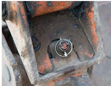
Photo 3: Another type of safety pin, in place and secured by a lynch pin to prevent it coming loose.